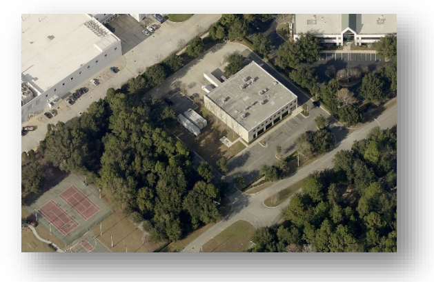
39,416 SF / $1,895,000