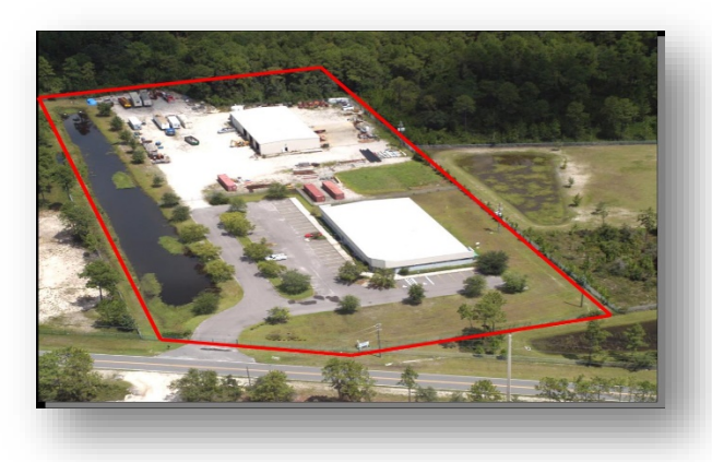
22,836 SF / $1,250,000