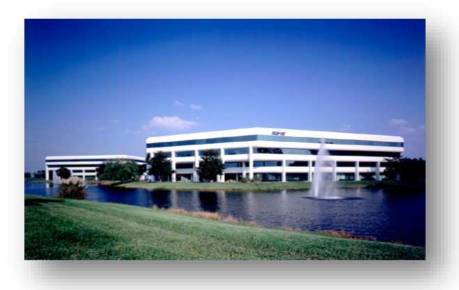
19,117 SF - 8.5 Acres / $2,800,000